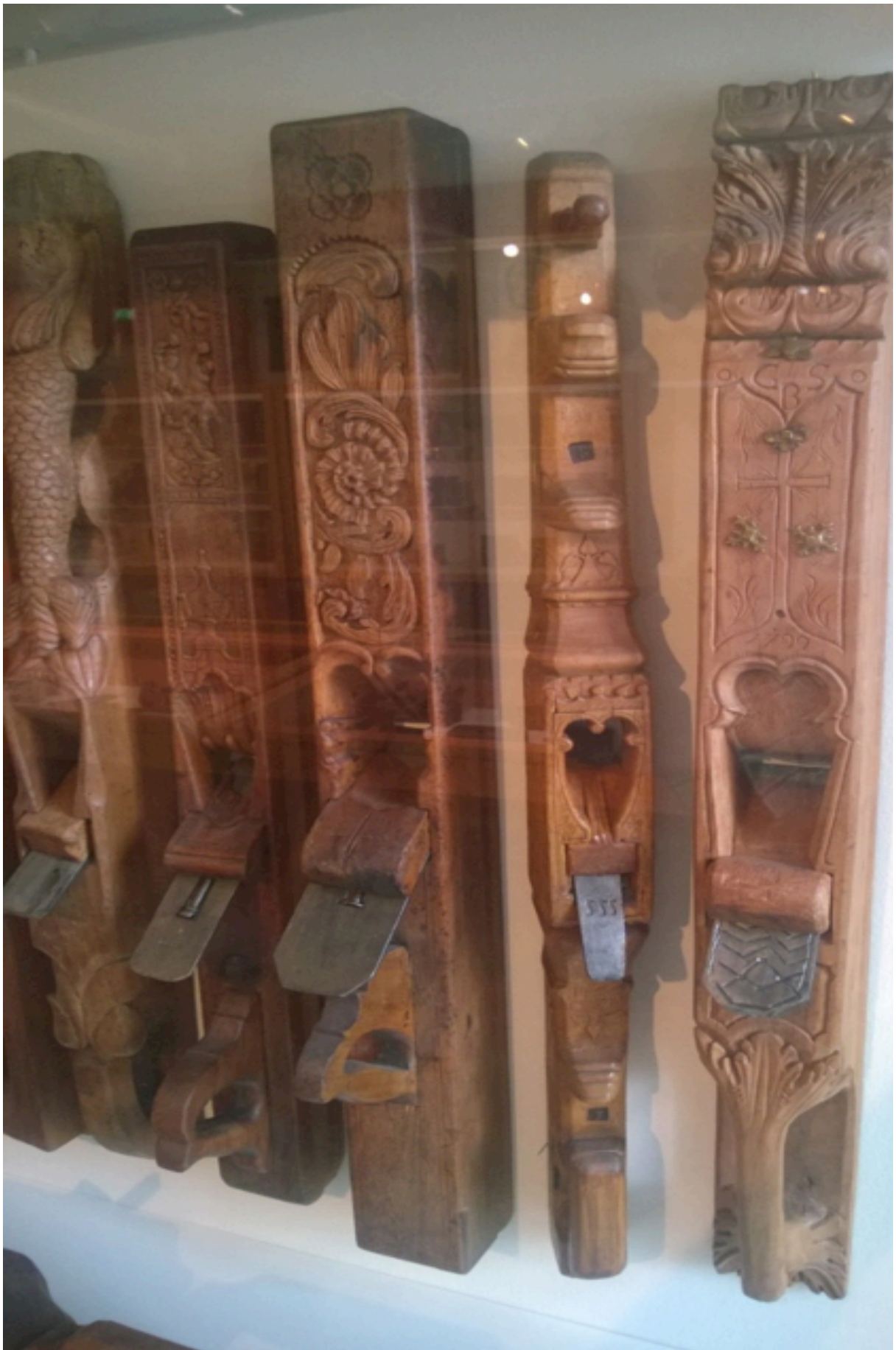
Figure 2, Ornamented jointer planes in museum at Innsbruck