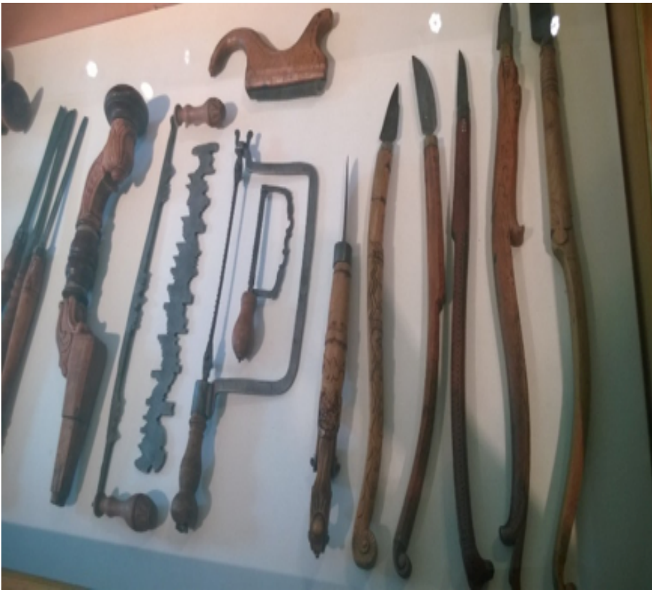
Figure 1, Edge Tools from Museum at Innsbruck

In the first picture above we see several types of tools. To the right are long knives used for carving in architectural contexts. The most fascinating tools to me, however, are the item which has handles like a draw knife, and the blade which rests beside it. Both of these are for making mouldings. They have a whole range of profile options all in one tool. What is curious to me, is how on earth they were used? Has anyone in this group ever seen anything like this?